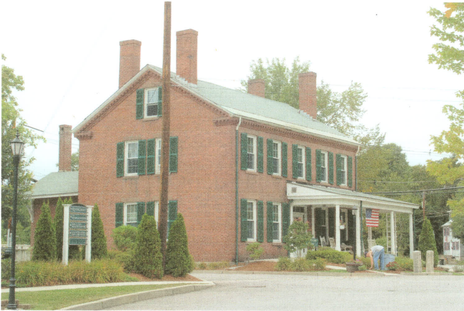
6 West Main Street