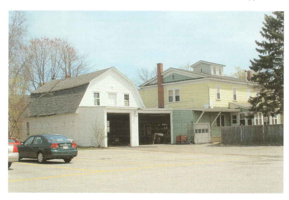
28 Station Avenue