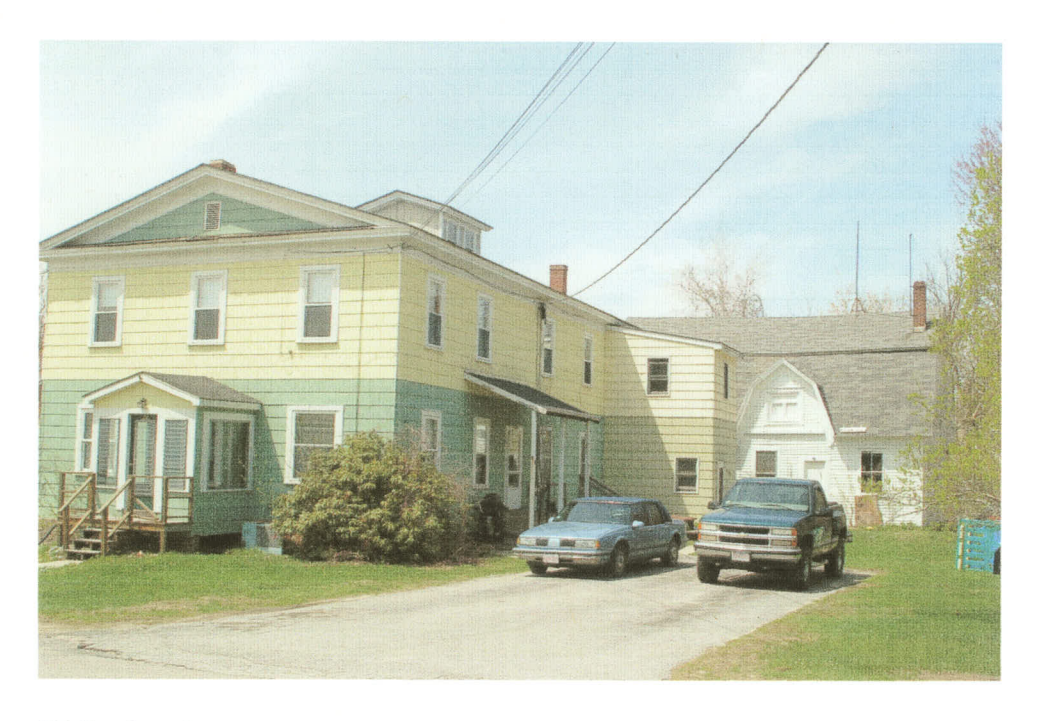
28 Station Avenue