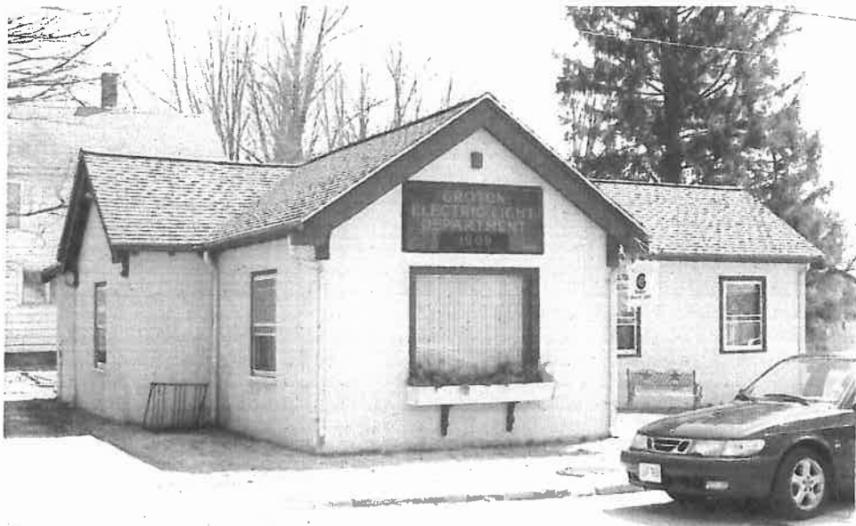
23 Station Ave., Groton Electric Light Dept.