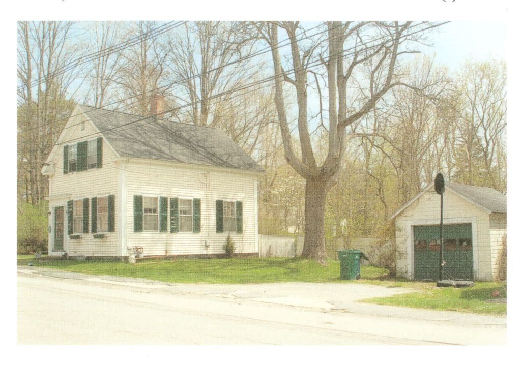
11 Station Avenue