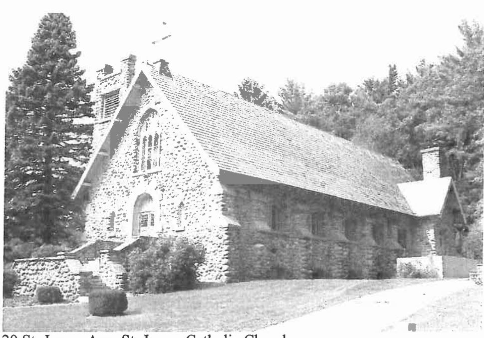
29 St. James Ave, St. James Catholic Church