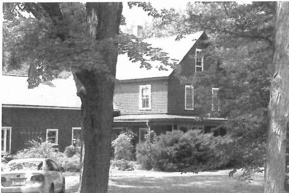
79 Schoolhouse Rd