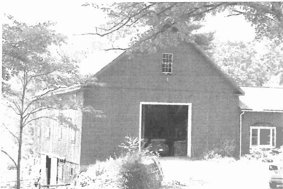
79 Schoolhouse Rd