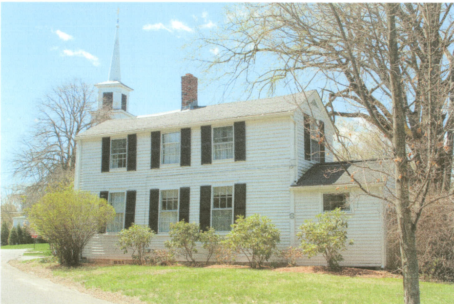
8 School Street