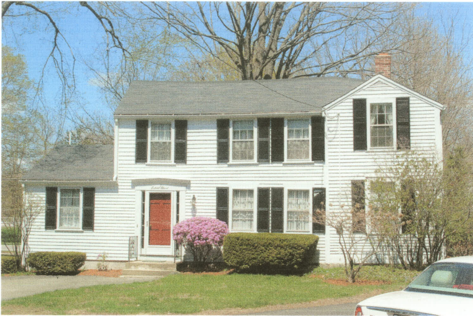
8 School Street