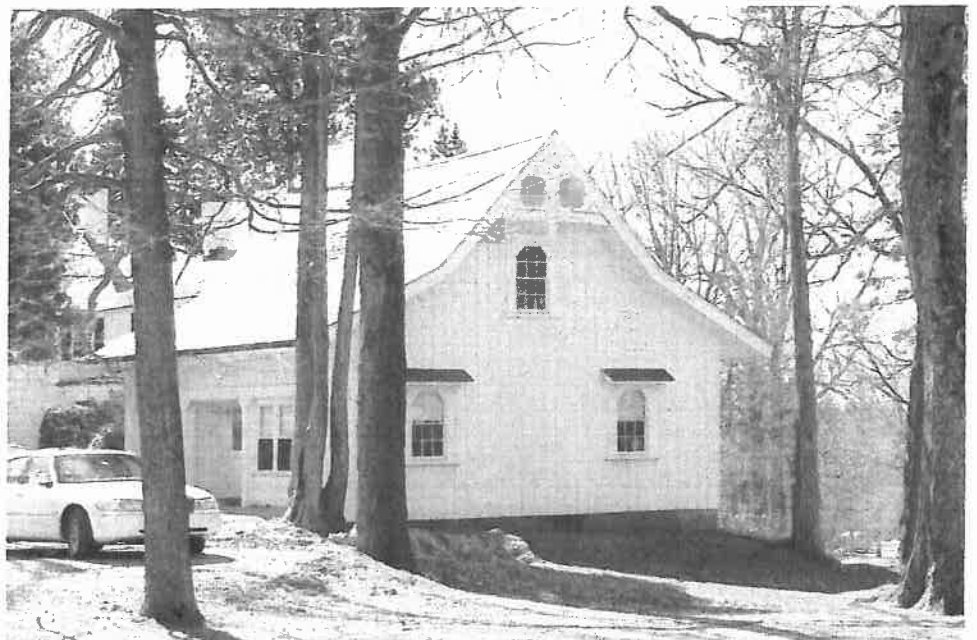
48 Powderhouse Rd, Sheedy Faculty Building outbuilding, Lawrence Academy