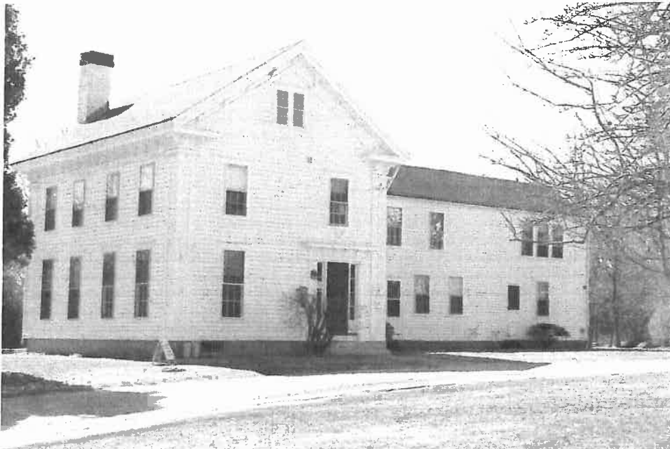
45 Powderhouse Rd, Pillsbury House, Lawrence Academy