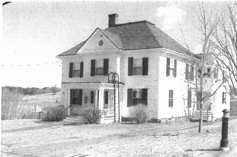
11 Powderhouse Rd, Lawrence House, Lawrence Academy