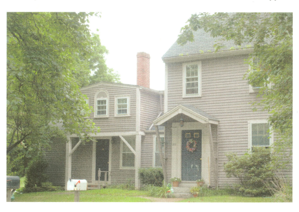
88 Pleasant Street