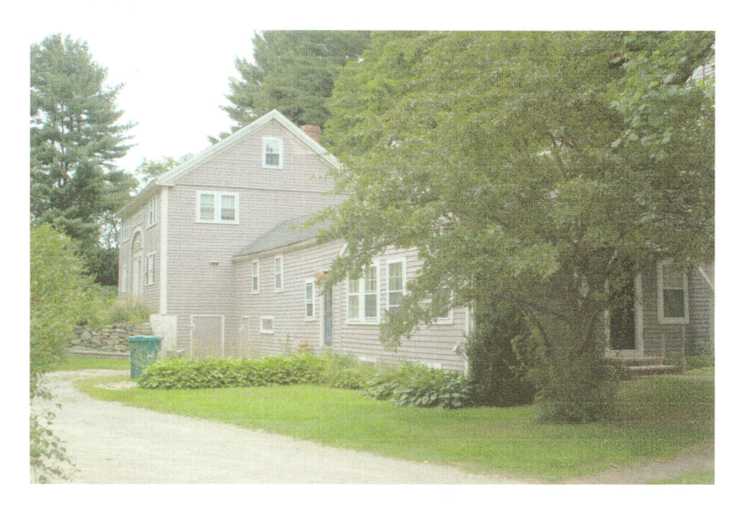
88 Pleasant Street