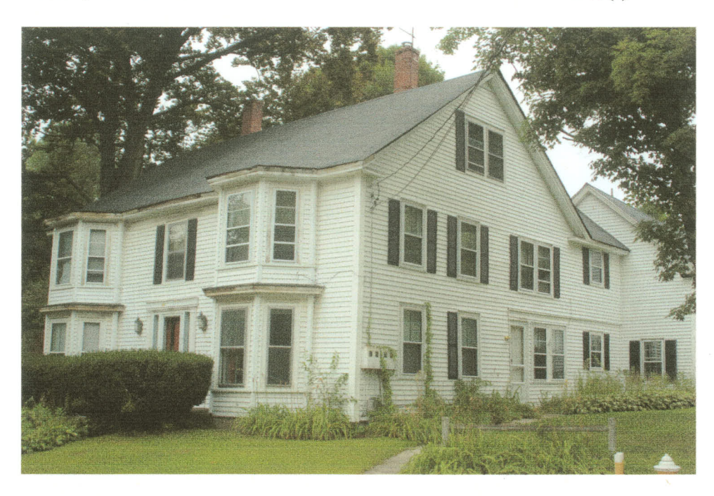
42 Pleasant Street