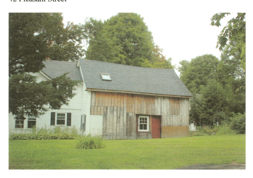
42 Pleasant Street