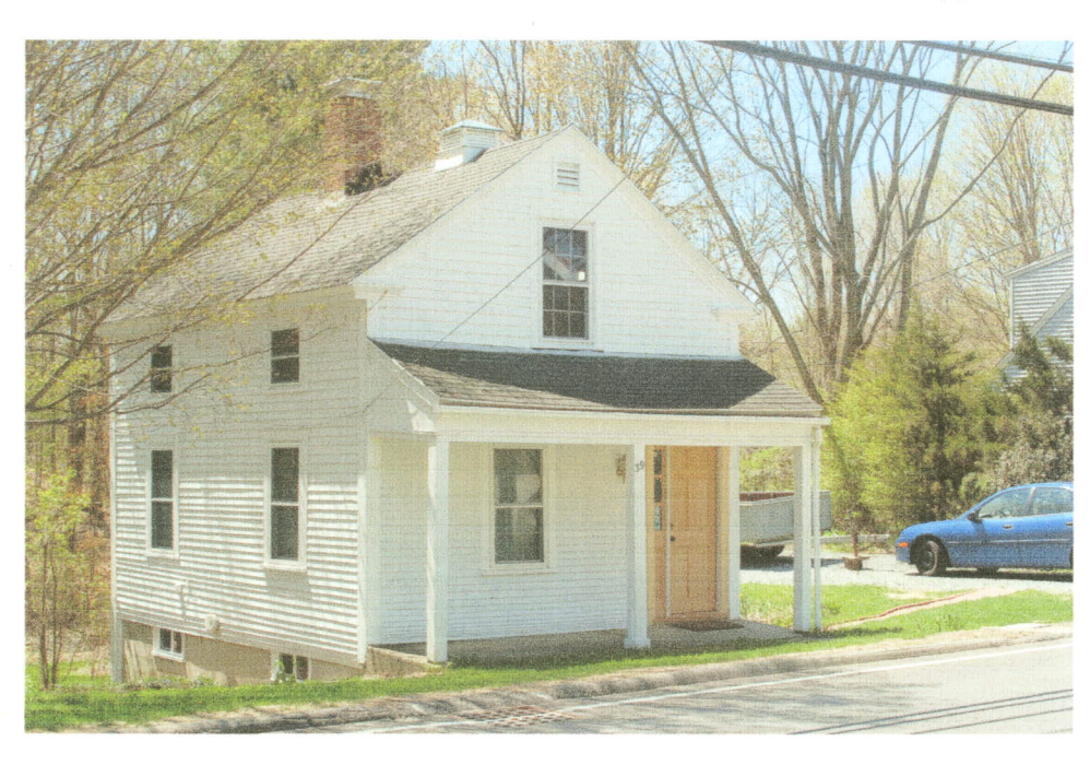
39 Pleasant Street