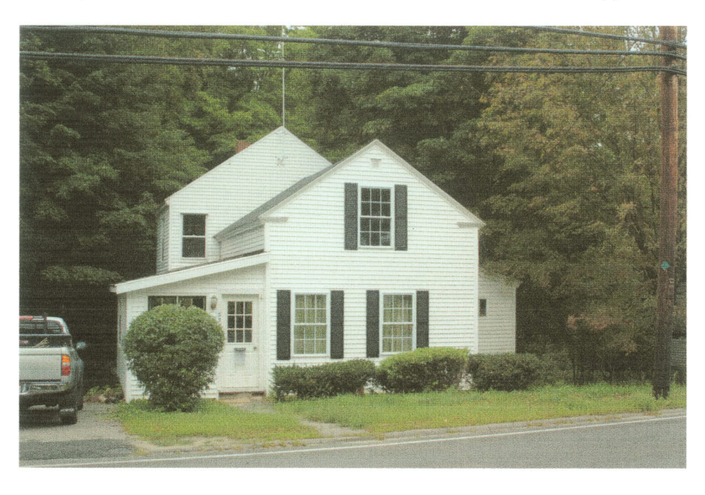
35 Pleasant Street