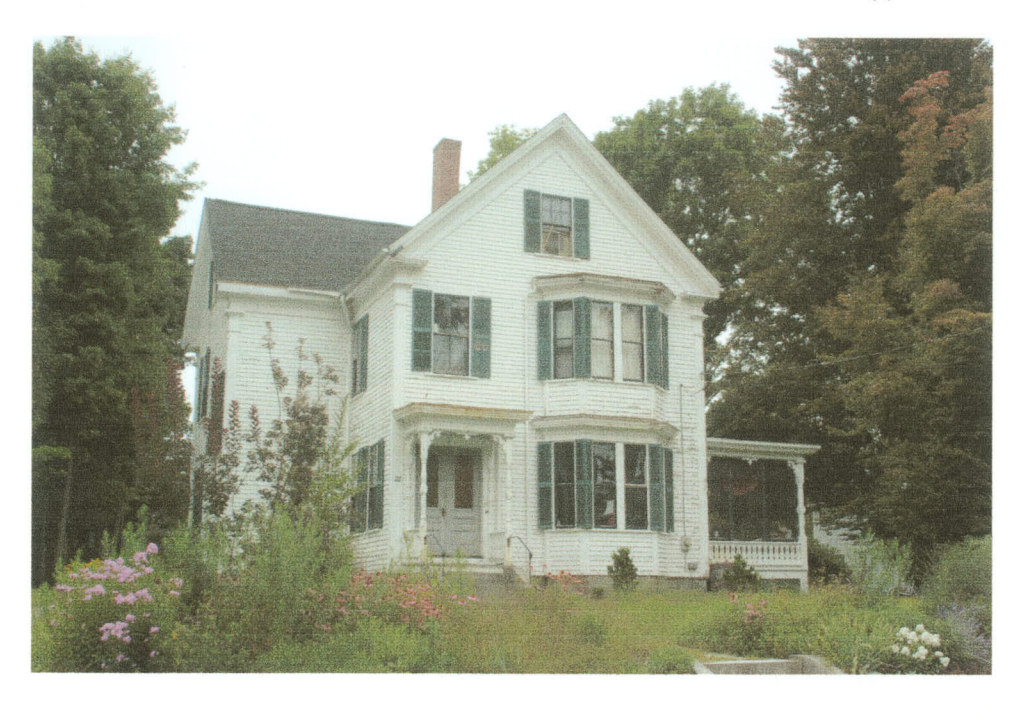
28 Pleasant Street