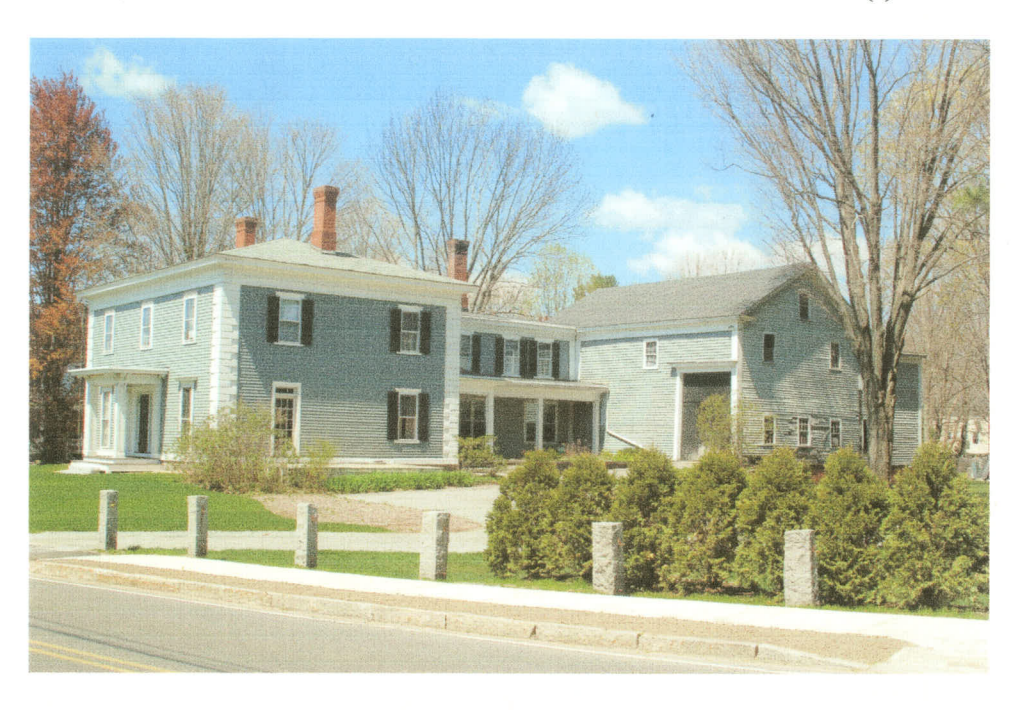
20 Pleasant Street