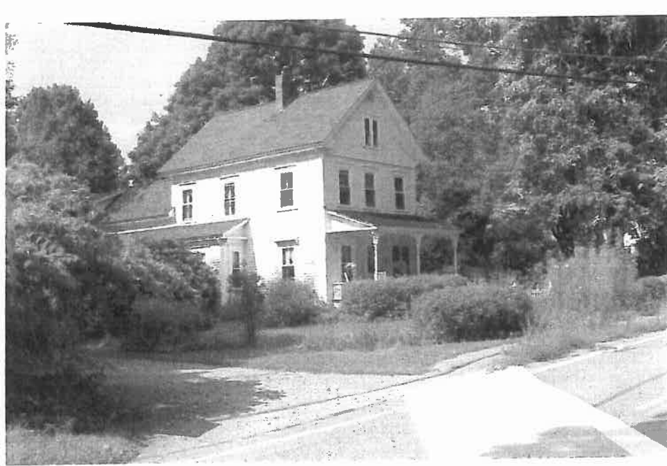
17 Pepperell Road