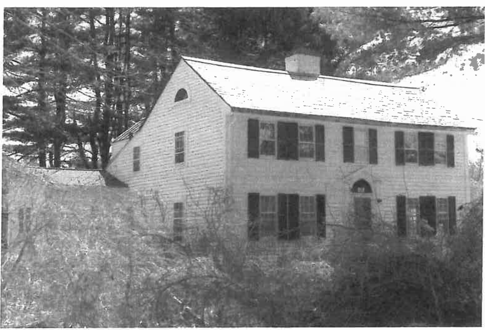
20 Peabody Street