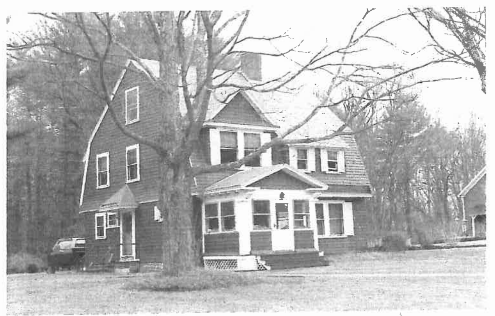
20 Old Orchard St