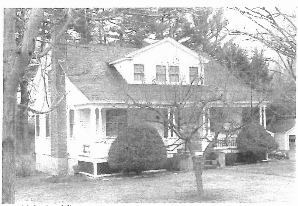
13 Old Orchard St