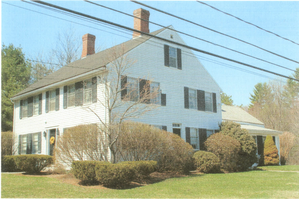
579 Old Dunstable Road