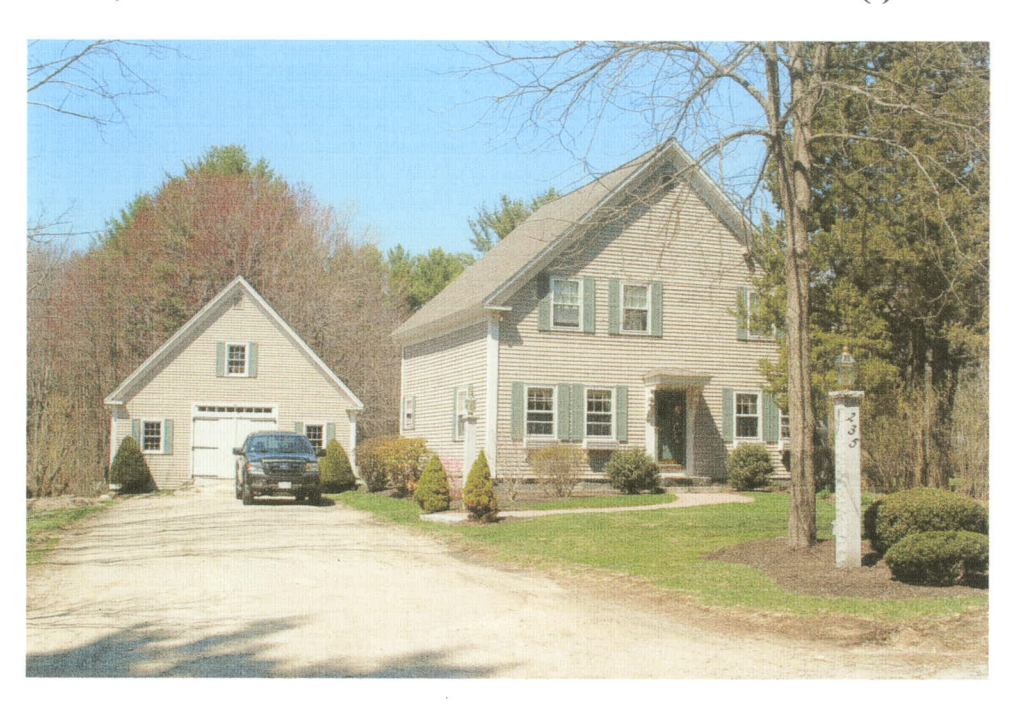
235 Old Dunstable Road