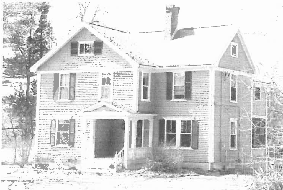
44 Old Ayer Road