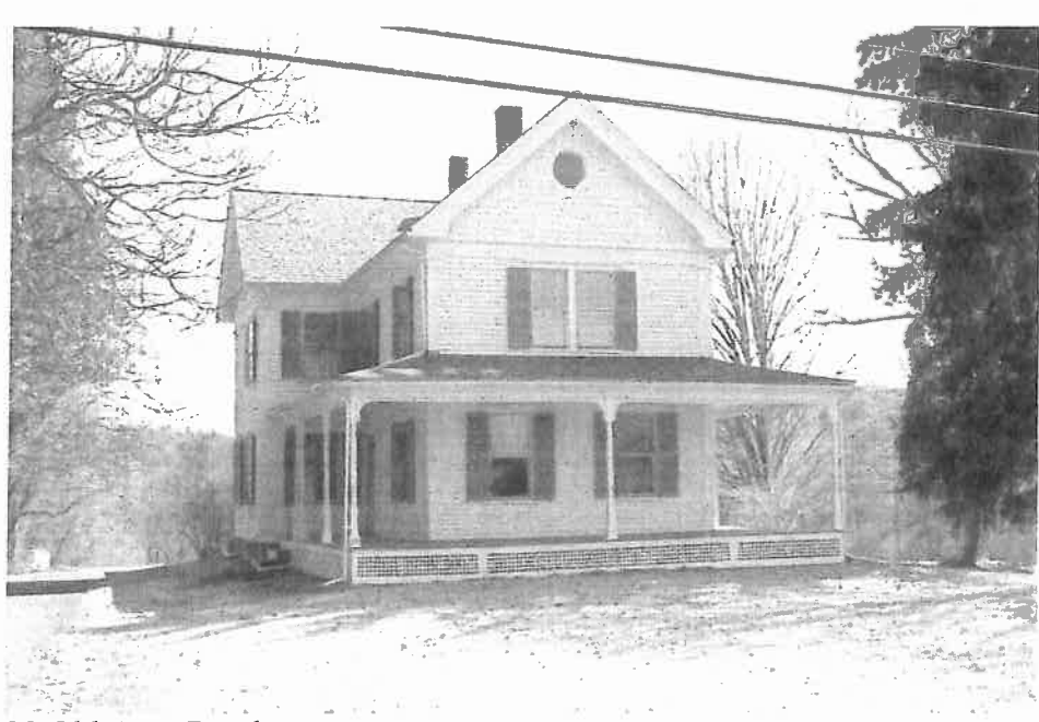
29 Old Ayer Road