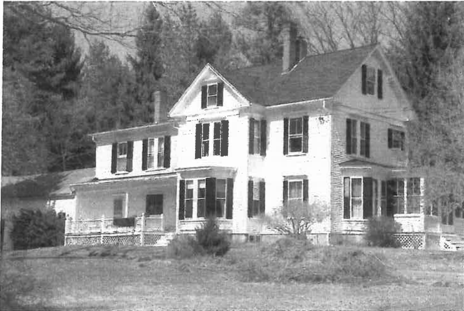
24 Old Ayer Rd