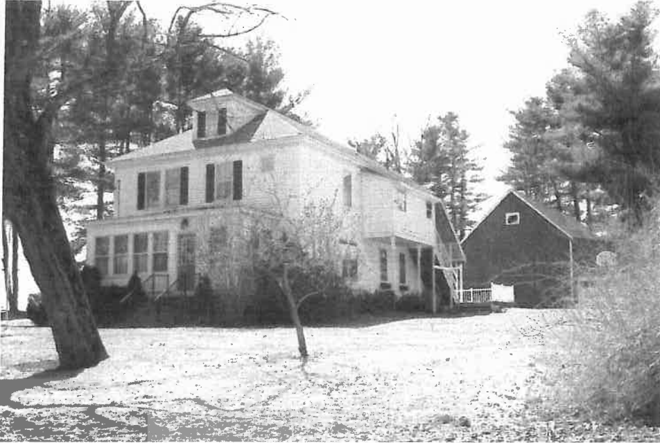
67 Mill St