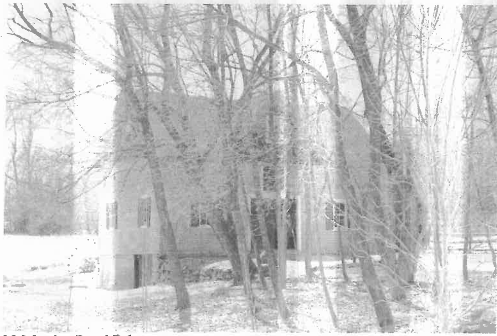
38 Martins Pond Rd