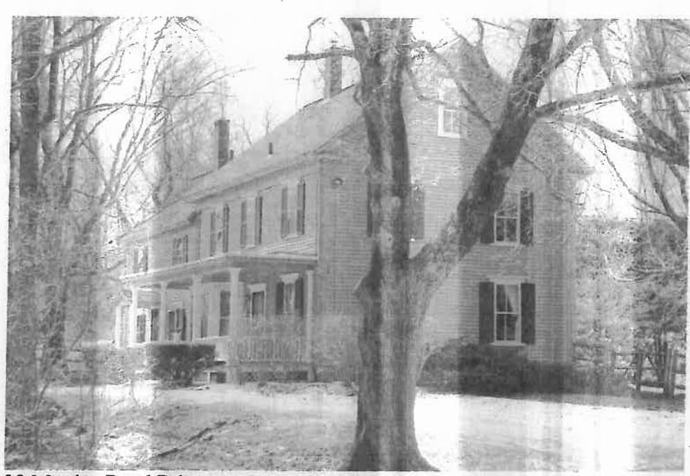
38 Martins Pond Rd