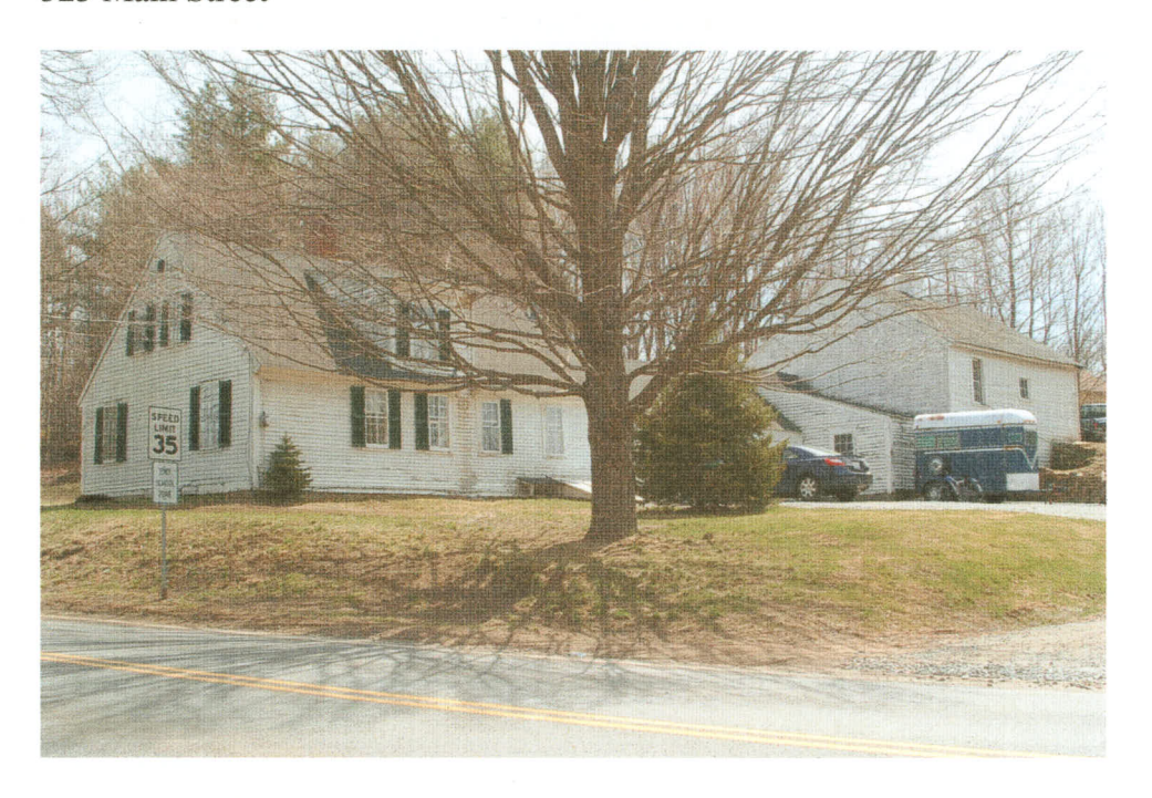
323 Main Street