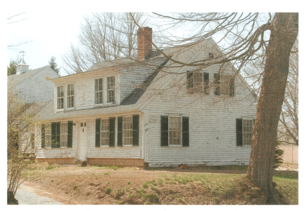
323 Main Street