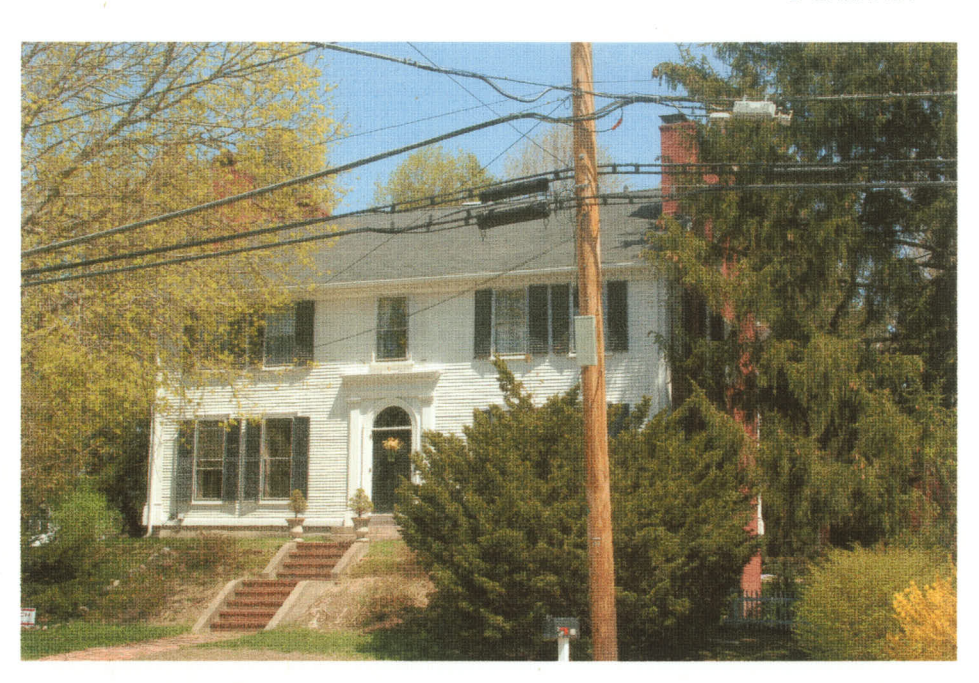
258 Main Street