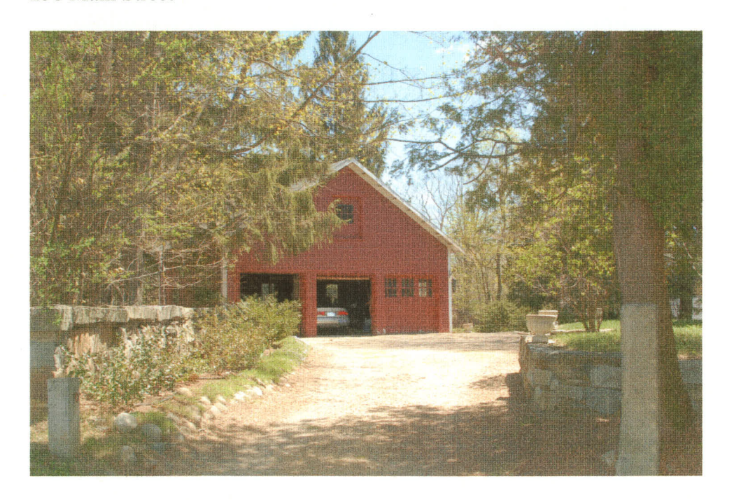
258 Main Street