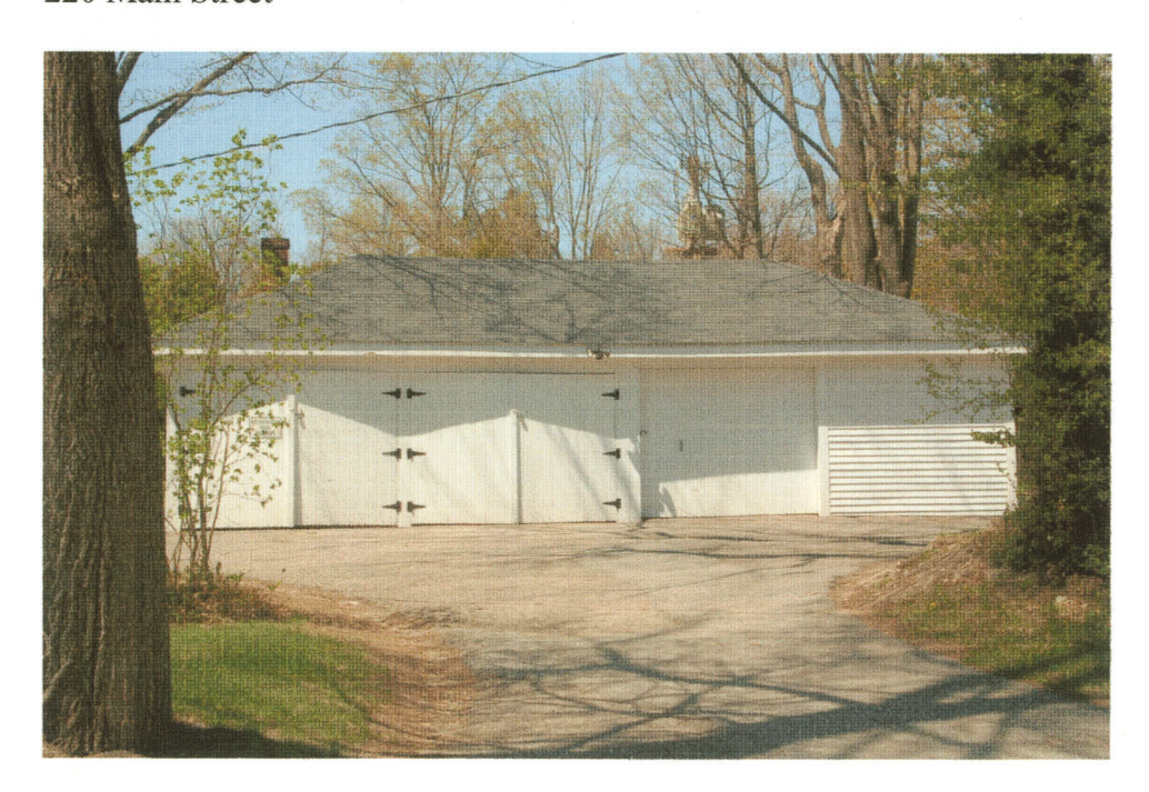
220 Main Street