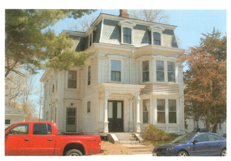
220 Main Street