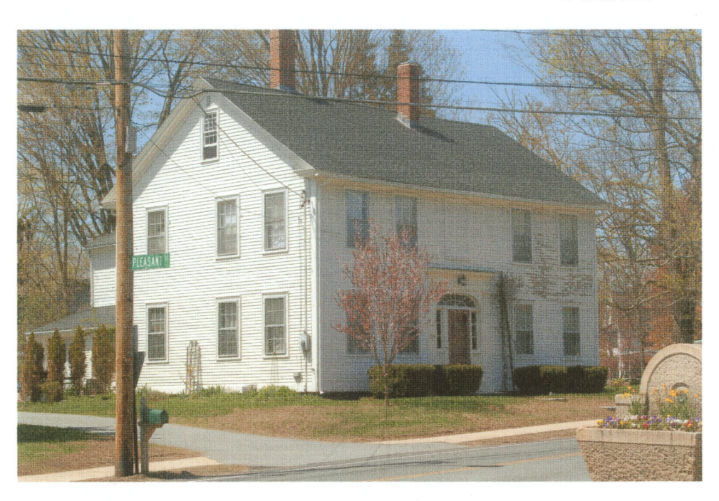
219 Main Street