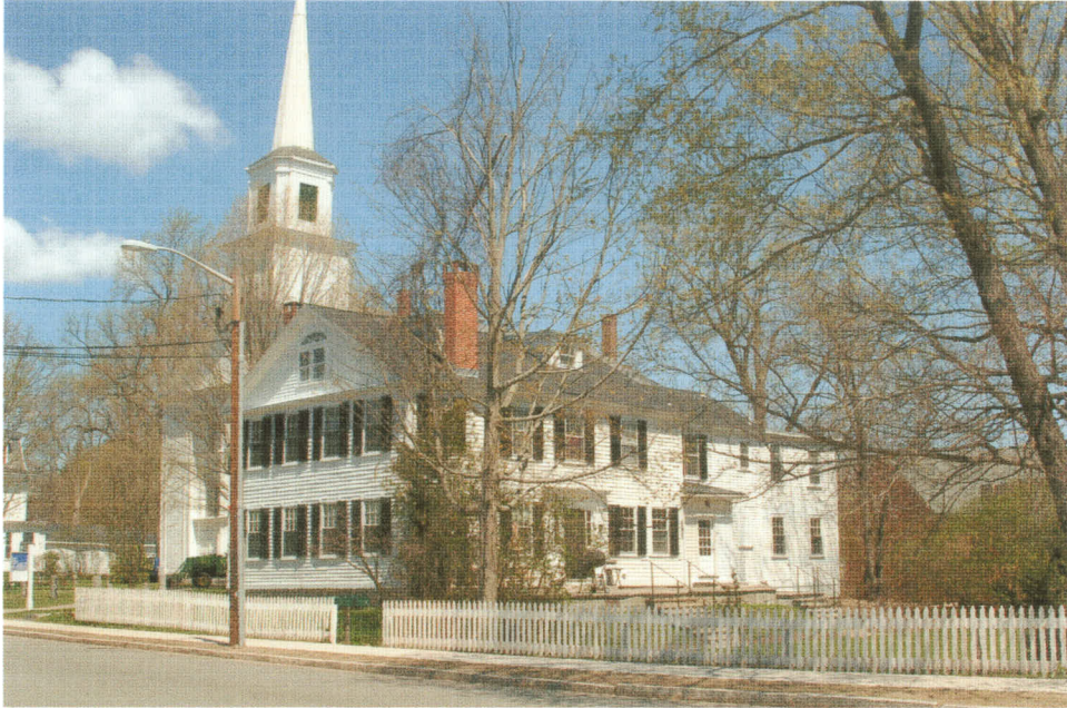
214 Main Street