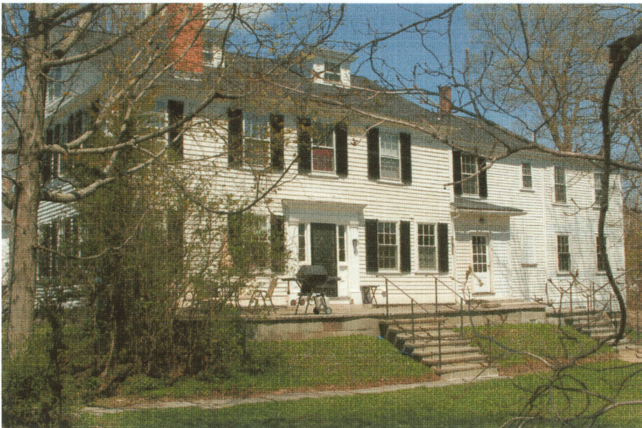
214 Main Street