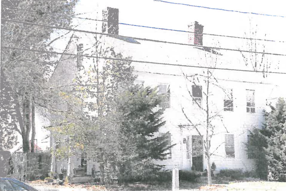
209 Main Street