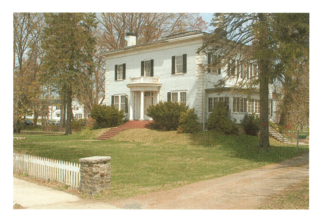
186 Main Street