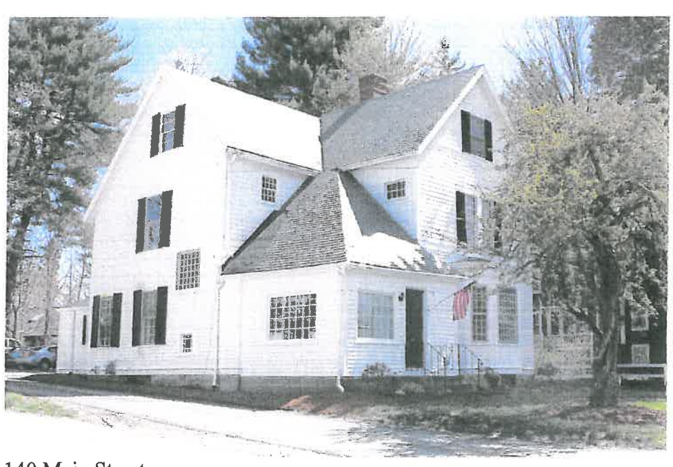
140 Main Street