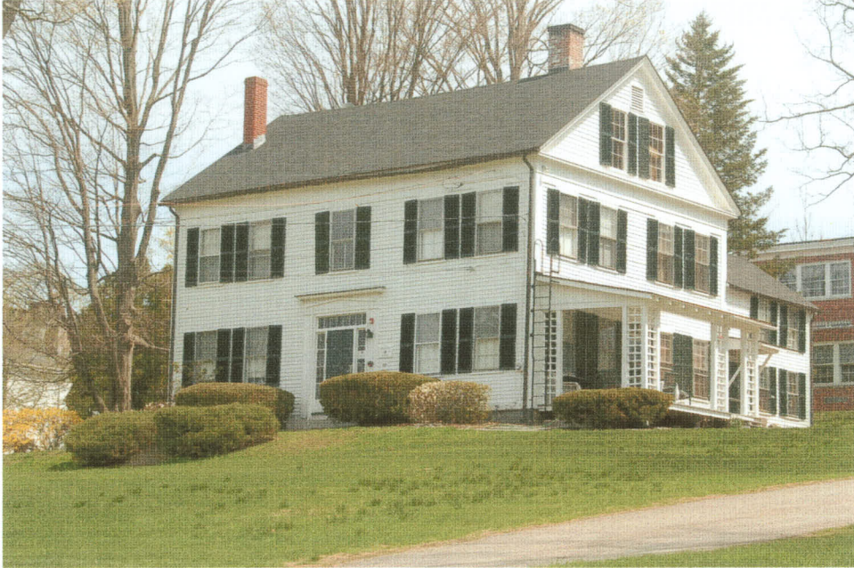
80 Main Street