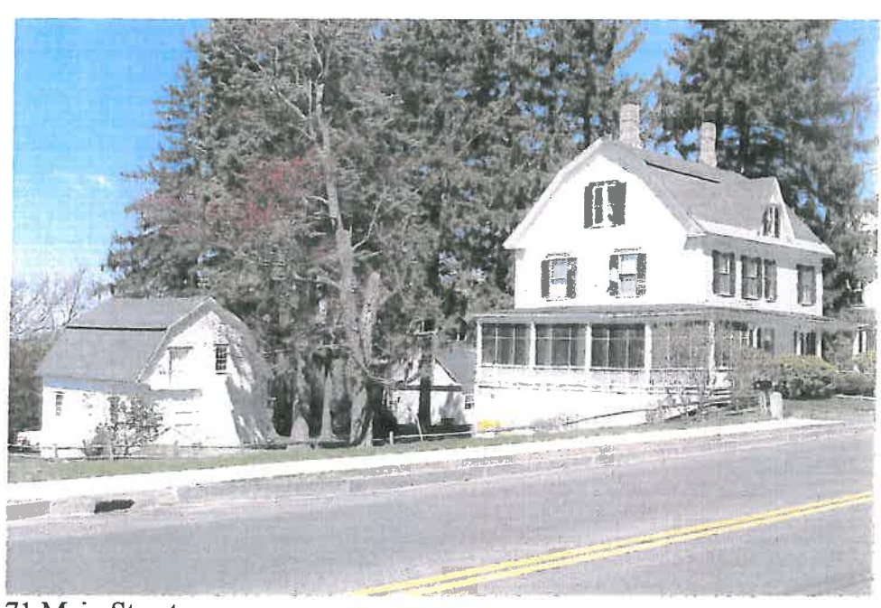
71 Main Street