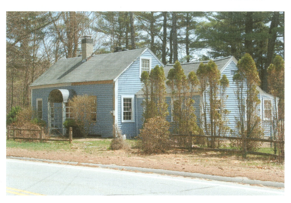
151 Long Hill Road