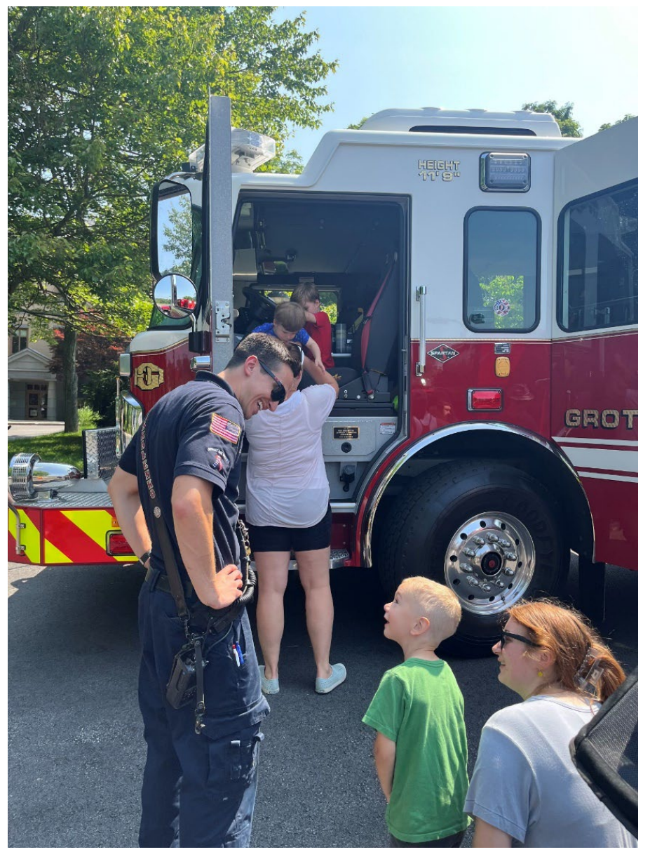
Touch-a-Truck event at the library, July 6, 2023