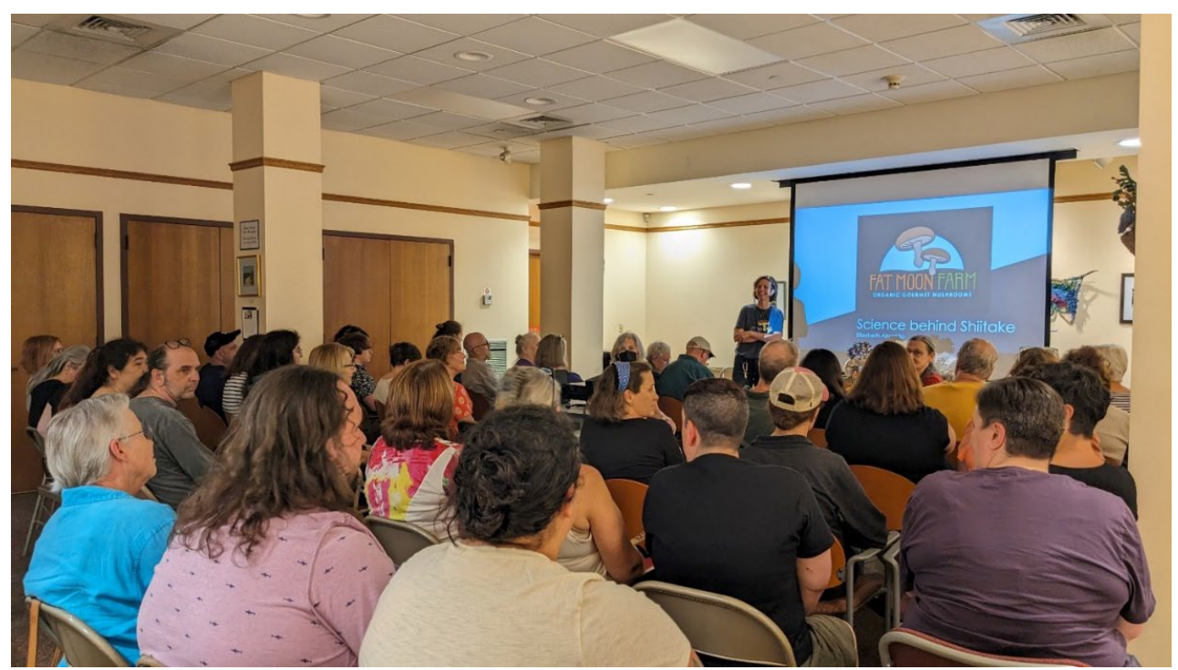
Packed crowd for growing your own mushrooms in Sibley Hall on Sept. 14, 2023