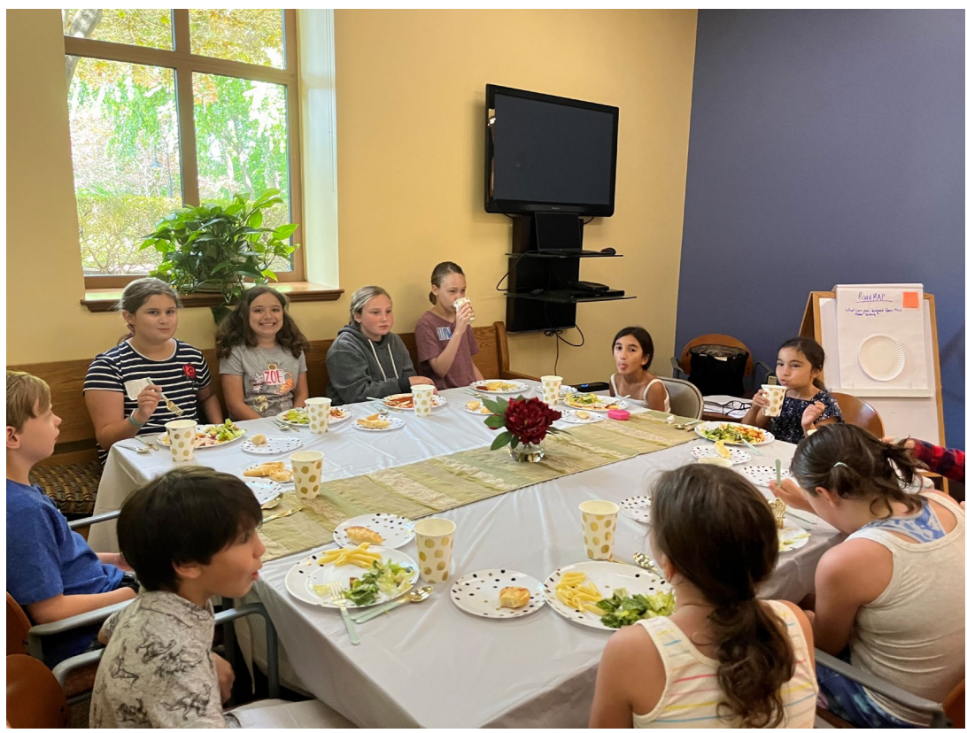
Learning table manners at etiquette camp, July 26, 2023