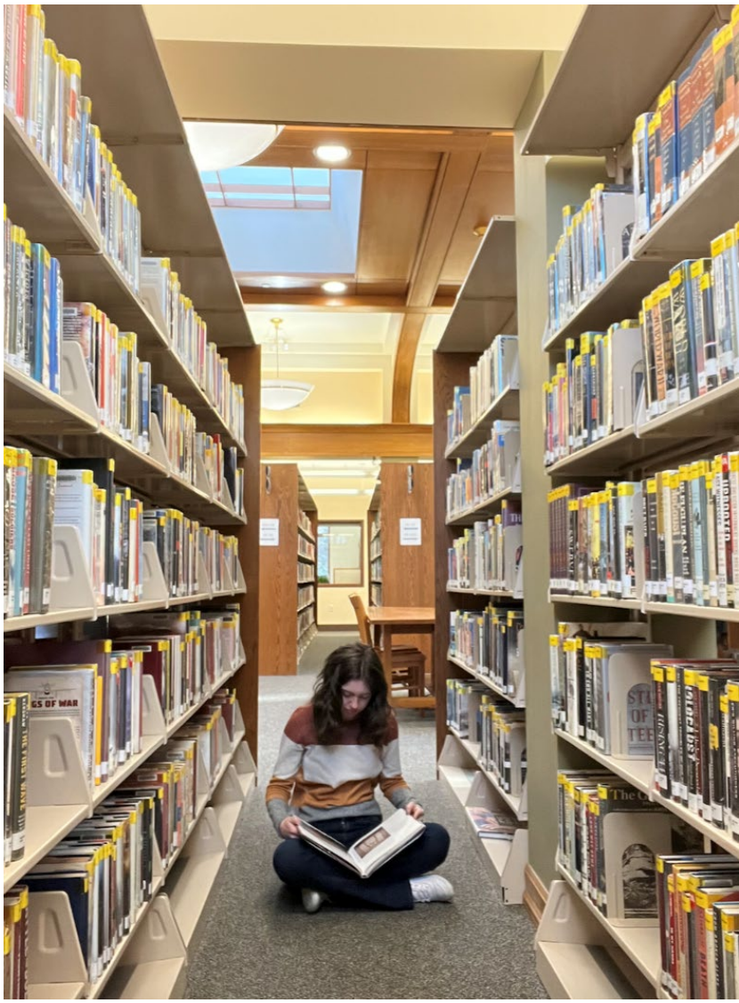
Reading in the stacks