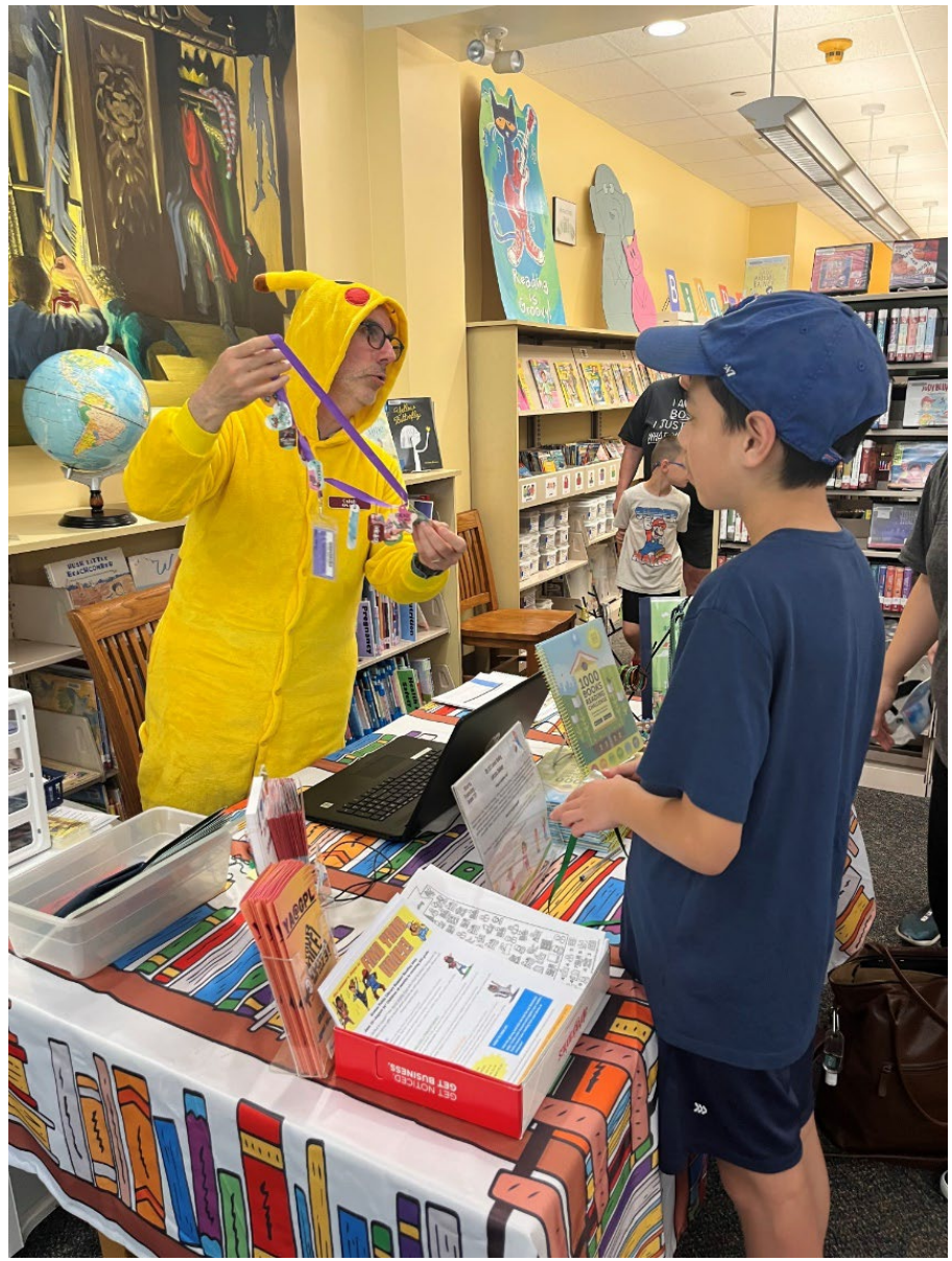
"Pikachu" signing up kids for summer reading in the Children's Room during FanFest, June 23, 2023