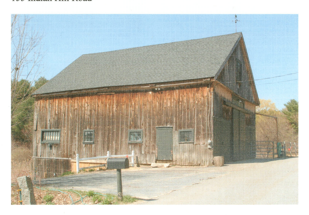
155 Indian Hill Road