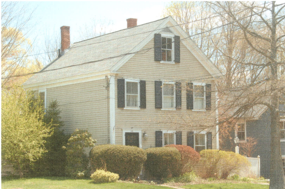
68 Hollis Street