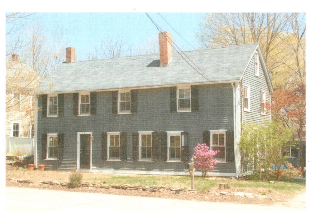
64 Hollis Street