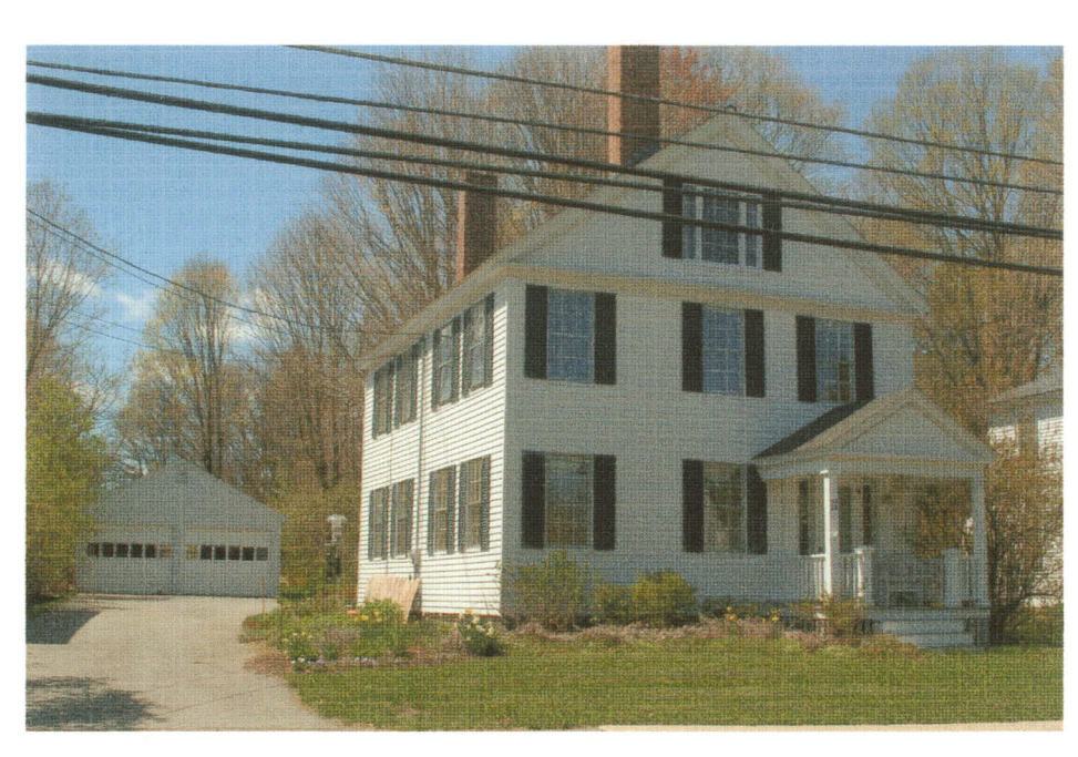
47 Hollis Street