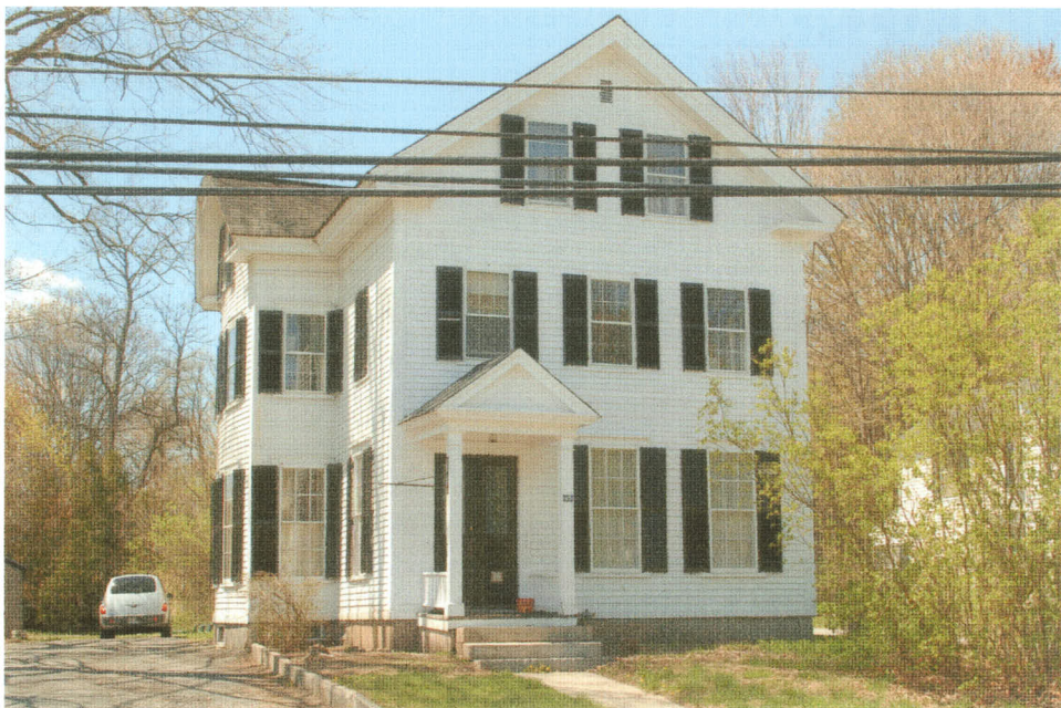
43 Hollis Street