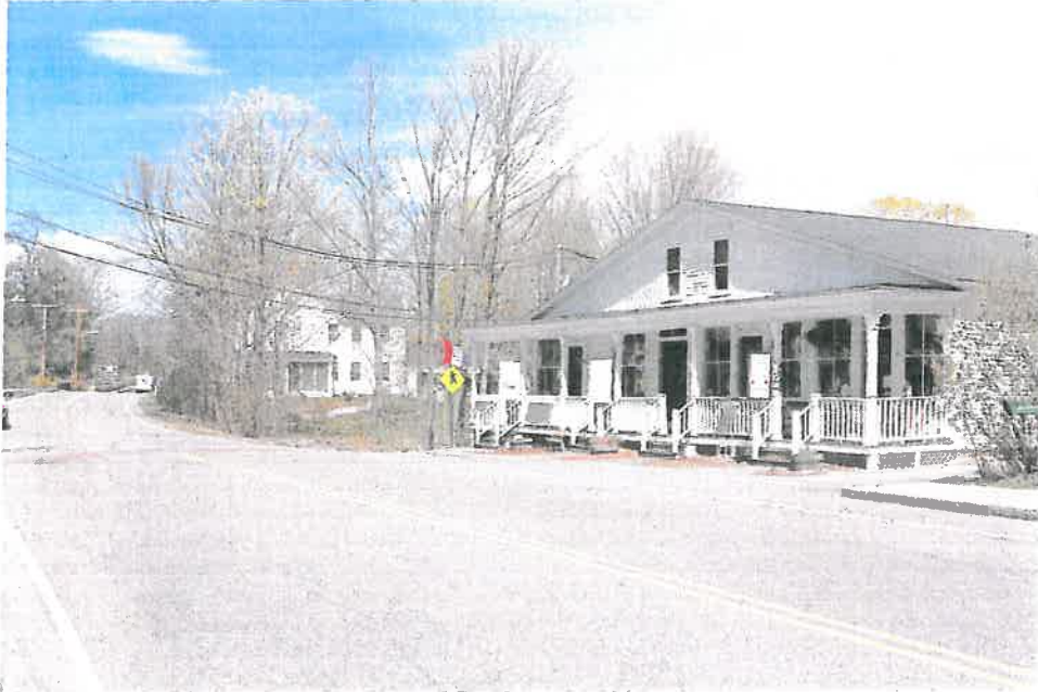
30 Hollis St