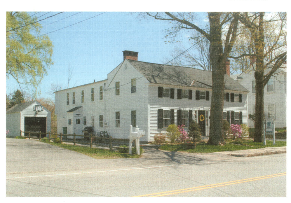
20 Hollis Street