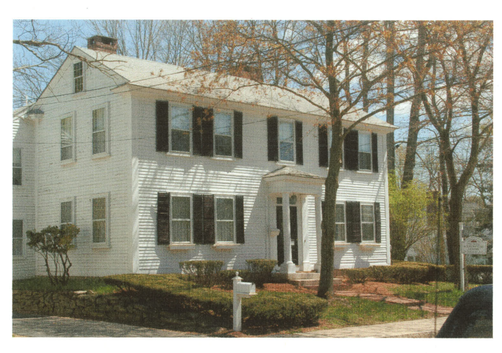
16 Hollis Street