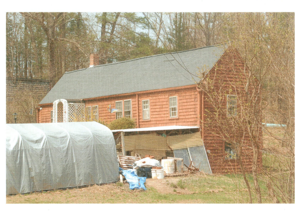
250 Hill Road