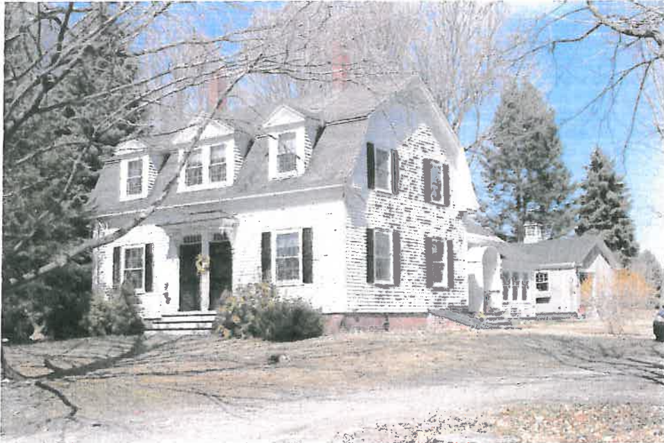
31-33 Higley St