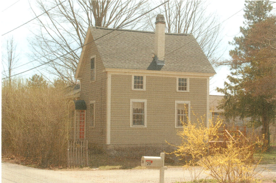
20 Higley Street