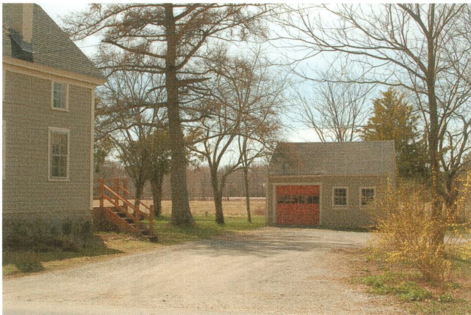
20 Higley Street